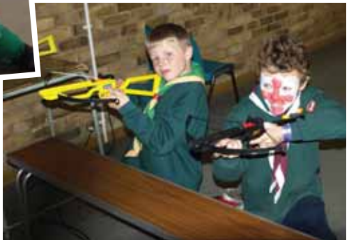
The St George's Day Celebration event took place at The Howard School on Sunday 25th April. The weather was good with plenty of activities.