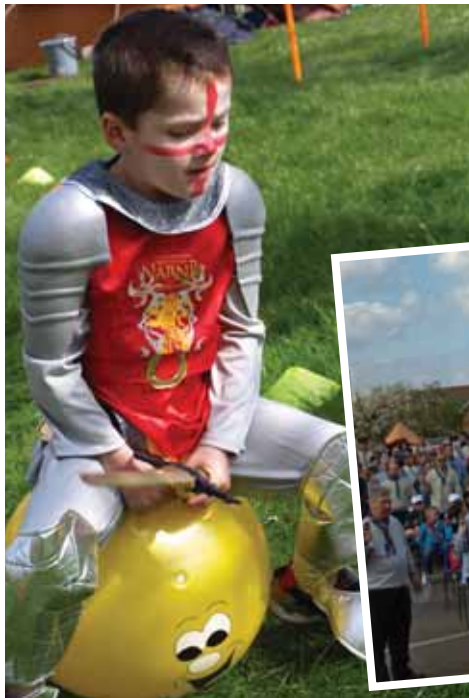
This photographic montage shows some of the activities on offer and the Renewal of Promises at the Scouts Own which was held before the activities started.