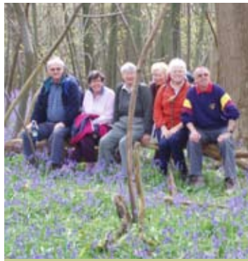
Members of the District Fellowship pause for a short break during their ramble around Chilham in April.